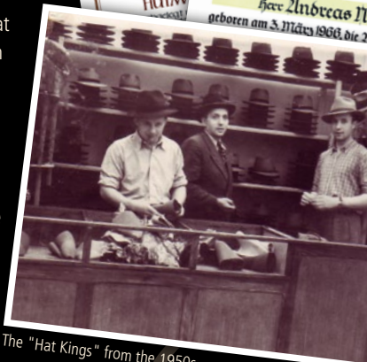
The "Hat Kings" from the 1950s

With tradition come obligations - today three generations are at your service.